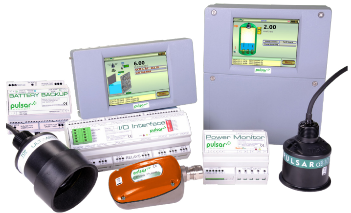
The Ultimate Controller Flow Group of Accessories

Data may also be downloaded locally via a removable SD card, while an internal SD card memory ensures that data is secure. Ultimate also offers optional Wi-Fi connectivity allowing you to access, program, and interrogate the system wirelessly.