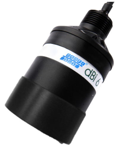
dBi6 Profibus PA Transducer with Submergence Shield.

dBi Profibus PA Transducers operate on the principle of timing and the echo received from a measured pulse of sound transmitted in air and utilize 'state of the art' echo extraction technology.